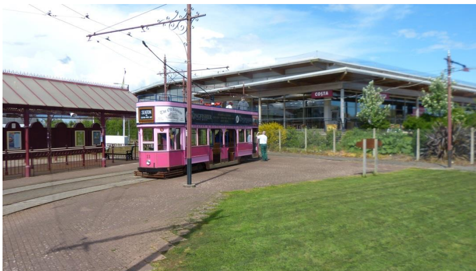
The "Pink One" – at Seaton – 19-5-2017.