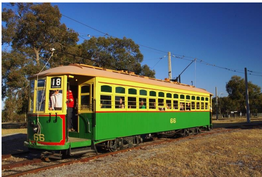
Perth 66 enjoys the sunshine – Photo Michael Stukely.

The Post Conference Tour Program is not quite ready at the time of publication of the News Update, but will be added as soon as possible. It will be placed on the COTMA Website as soon as it is available.