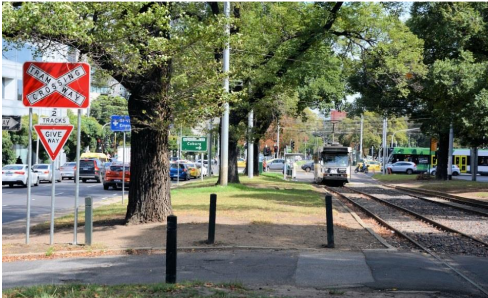
Melbourne does have at least one signed tramway level crossing – at a small road crossing in Victoria Parade, opposite St Vincents Hospital

This problem is now being reviewed. Tramway operators are seeking to exclude light rail and trams from the definition of a level crossing unless it has a level crossing sign as such. This would also be applicable to pedestrian crossings where they are independent of a road. New Zealand has appropriately excluded tramways or light rail in its legislation as does Victoria. COTMA will be supporting the recommendation made by the Rail Safety Director of the Gold Coast Light Rail.