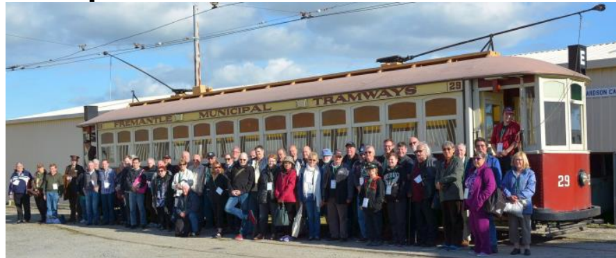
COTMA conference participants in Perth