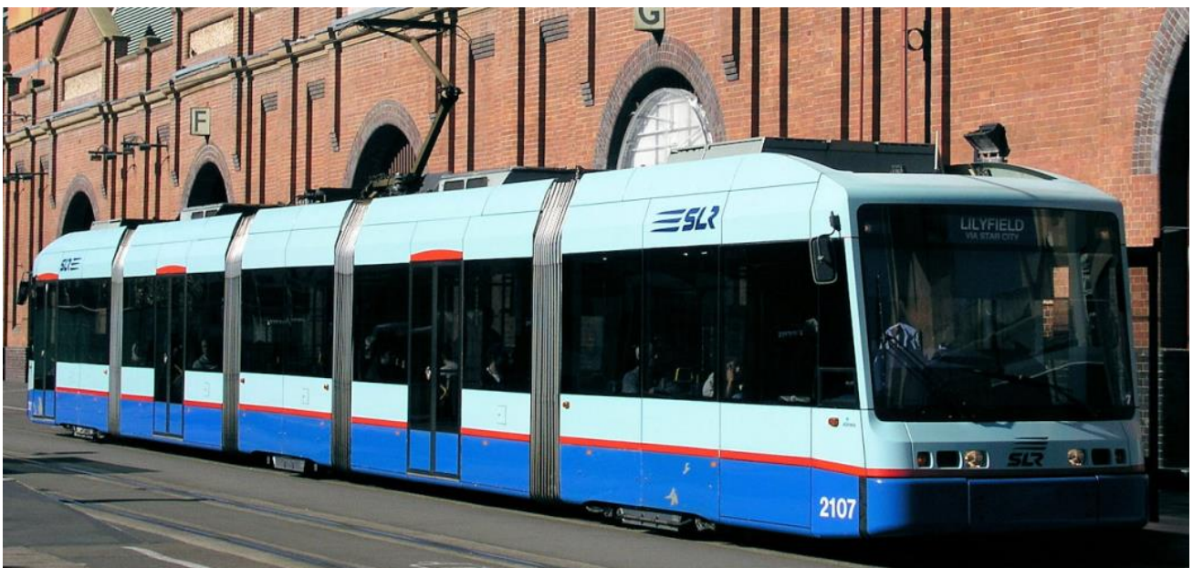
Variortram 2107 in service in 2005 – Photo by Mal Rowe

The Sydney Tramway Museum took delivery of the 1997 Sydney Variotram 2107 on the night of the 10/11 October. The tram remains the property of the NSW State Government with the Museum “caring” for the tram. It took some three years and a lot of paperwork to achieve this outcome. It is the Museum’s largest exhibit. For more details see: http://www.sydneytramwaymuseum.com.au/tramfans/sydney-variortram-2107-arrives-at-loftus/