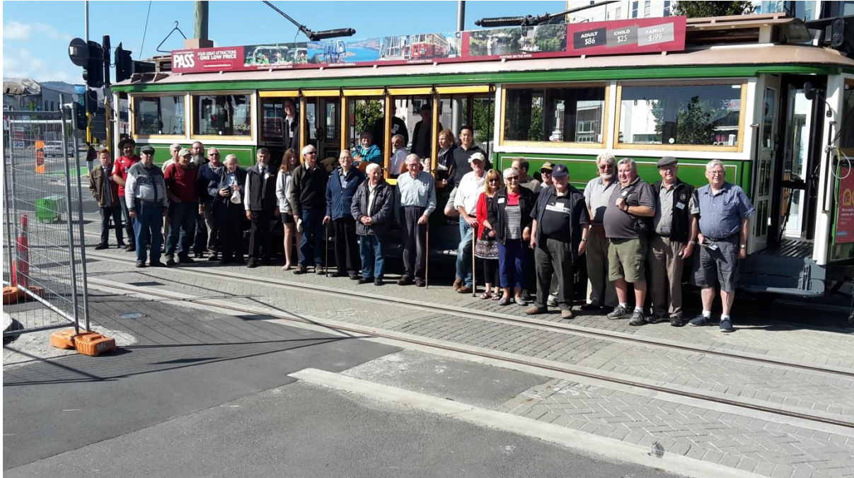
THS Members and Friends line up in front of Boon 152 while touring the Christchurch City Tramway – 7 Jan. 2018.

Sunday began with a visit to the city tramway and a ride around the full circuit in ChCh Boon 152, originally restored by THS volunteers in the late 1970s, and then back to Ferrymead for “steam Sunday” which turned out to be very busy with more than 1200 people through the gates. No 1 with DD trailer 74 and DD tram 26 were busy all day. Again an enjoyable event with many asking about when the next anniversary/reunion might be - 9 May 2020 is a definite possibility – that will be 50 years since the Ferrymead electric tramway was officially opened!