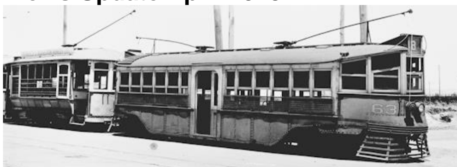
Perth 63 in 1952