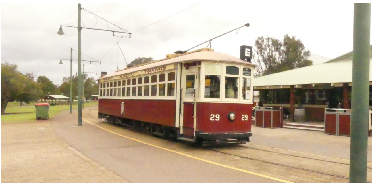
PET's Fremantle No. 29 outside the Whiteman Park Café.