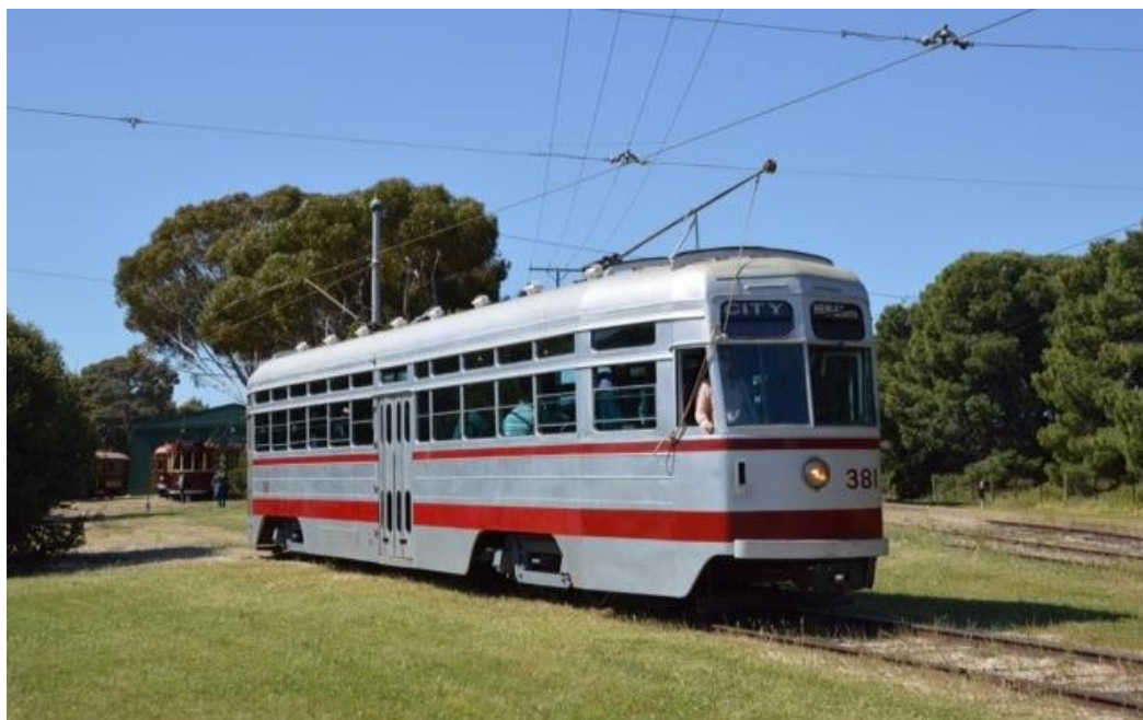
Below – Car 381 leaving the Museum 1-10-17

COTMA congratulates the AETM on reaching its 60 th anniversary and may there be many more. In 2018, the AETM will celebrate 60 years at the St Kilda site.