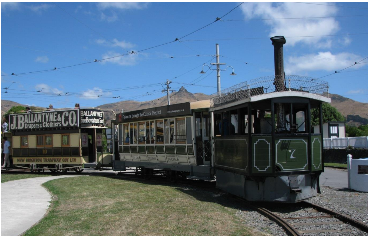
The original 1968 tram set re-enactment. Not in the photo is Dunedin 22 pushing! Even the cloud lined up to give smoke coming from No. 7!